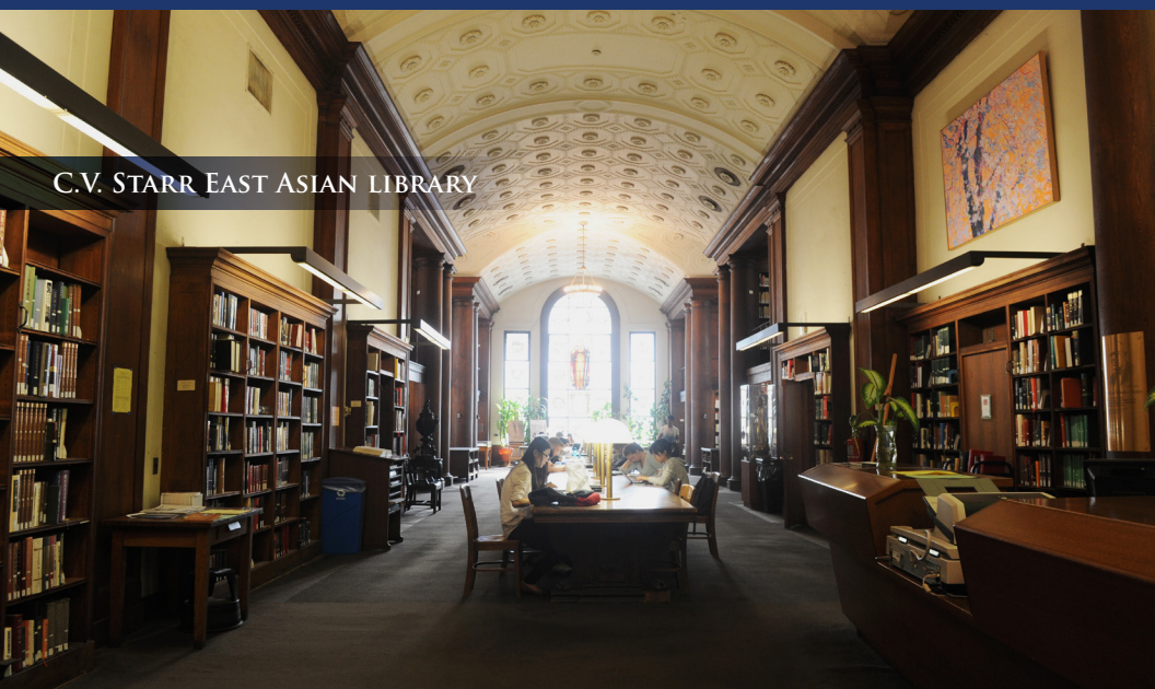
C.V. STARR EAST ASIAN LIBRARY

We offer lab spaces, specialized software, and staff with specific expertise in a range of software and technologies. Printing is available in most libraries for use with a Columbia printing quota. Scanning is available in most libraries: library.columbia.edu/technology